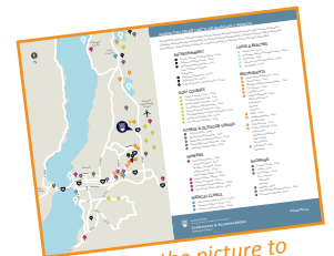
Click on the picture to see the amenities map.

AIR: Kelowna International Airport (YLW) is across from campus and has daily flights to and from Seattle, Vancouver, Toronto, Calgary, Edmonton, Victoria, Cranbrook, Fort McMurray, Whitehorse and Prince George.