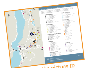
Click on the picture to see the amenities map.

AIR: Kelowna International Airport (YLW) is across from campus and has daily flights to and from Seattle, Vancouver, Toronto, Calgary, Edmonton, Victoria, Cranbrook, Fort McMurray, Whitehorse and Prince George.