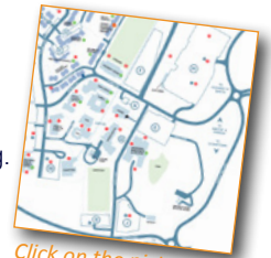
Click on the picture to see the campus map.

Every residence building has a VENDING MACHINE with snacks and drinks! CATERED MEALS are available through Classic Fare Catering or Students' Union Catering.