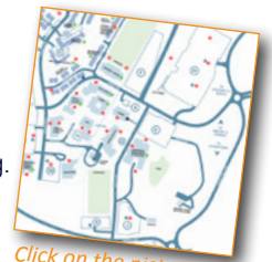
Click on the picture to see the campus map.

Every residence building has a VENDING MACHINE with snacks and drinks! CATERED MEALS are available through Classic Fare Catering or Students' Union Catering.