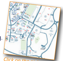
Click on the picture to see the campus map.

Every residence building has a VENDING MACHINE with snacks and drinks! CATERED MEALS are available through Classic Fare Catering or Students' Union Catering.