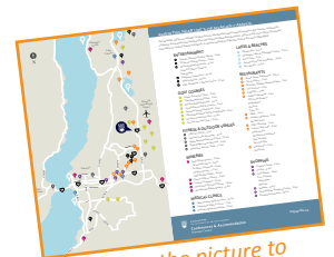
Click on the picture to see the amenities map.

AIR: Kelowna International Airport (YLW) is across from campus and has daily flights to and from Seattle, Vancouver, Toronto, Calgary, Edmonton, Victoria, Cranbrook, Fort McMurray, Whitehorse and Prince George.