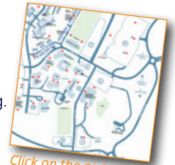
Click on the picture to see the campus map.

Every residence building has a VENDING MACHINE with snacks and drinks! CATERED MEALS are available through Classic Fare Catering or Students' Union Catering.