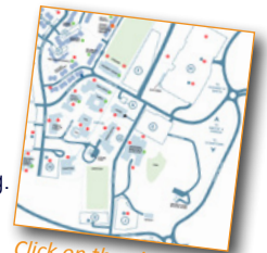
Click on the picture to see the campus map.

Every residence building has a VENDING MACHINE with snacks and drinks! CATERED MEALS are available through Classic Fare Catering or Students' Union Catering.