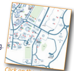
Click on the picture to see the campus map.

Every residence building has a VENDING MACHINE with snacks and drinks! CATERED MEALS are available through Classic Fare Catering or Students' Union Catering.