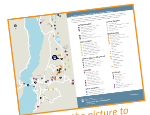
Click on the picture to see the amenities map.

AIR: Kelowna International Airport (YLW) is across from campus and has daily flights to and from Seattle, Vancouver, Toronto, Calgary, Edmonton, Victoria, Cranbrook, Fort McMurray, Whitehorse and Prince George.