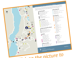
Click on the picture to see the amenities map.